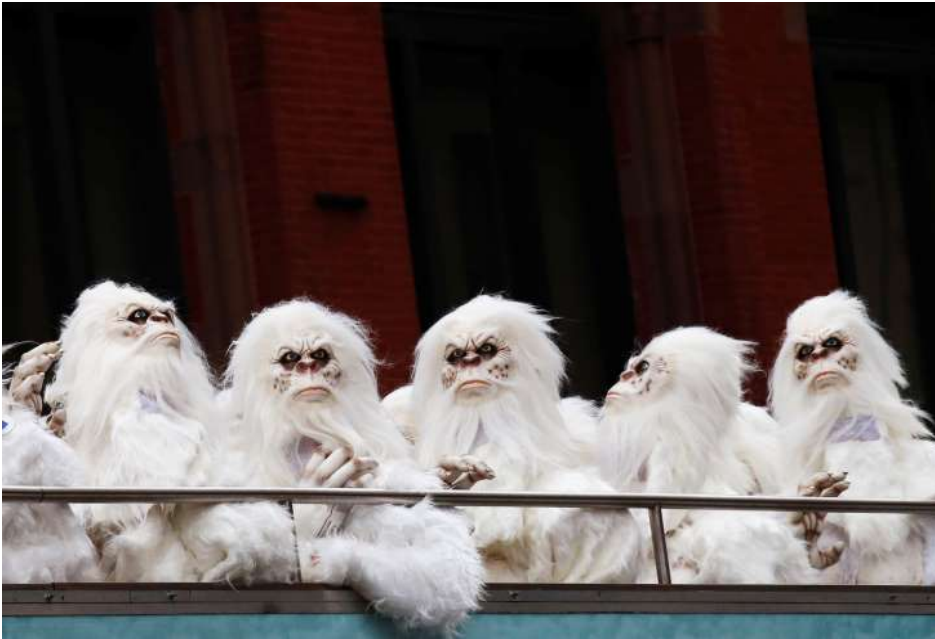
Actors dressed as a "Yeti" ride aboard a tour bus during a promotional event for Travel Channel's "Expedition Unknown: Hunt for the Yeti" in Manhattan, New York City, U.S., October 4

The yeti is a creature of folklore in the Himalayan region that has become a part of Western popular culture. It is separate from North America's Sasquatch and Big Foot folklore.