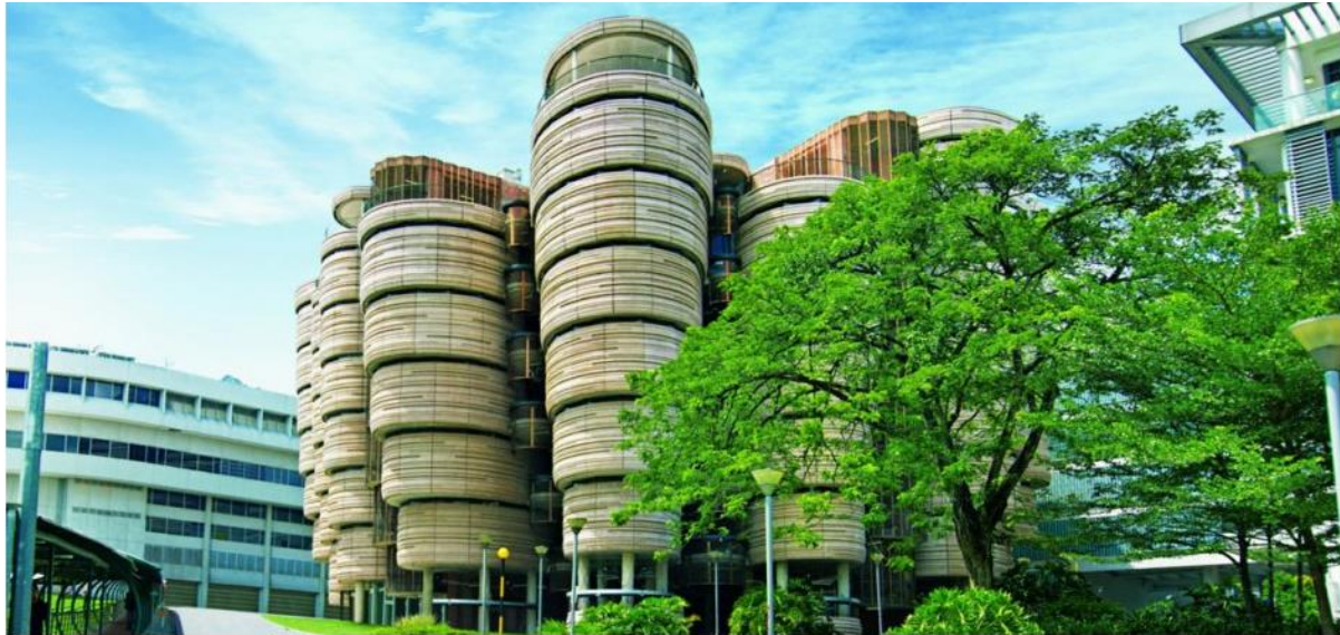
The Hive at NTU is the centrepiece of the university's flipped classroom pedagogy, a new model of education in the digital age.