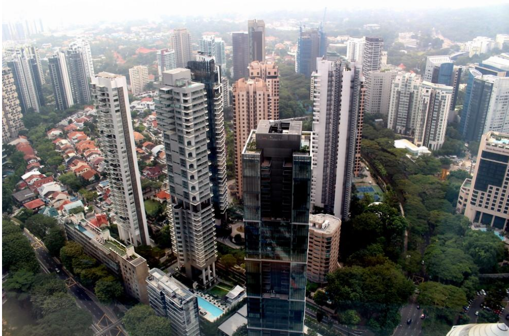
The city state has consistently performed well in global university rankings.

However, in Times Higher Education's World University Rankings 2018, the gap between the two rivals are much bigger, spanning 30 spots. NTU was at 52nd spot, while NUS shared the 22nd place with Canada's University of Toronto.