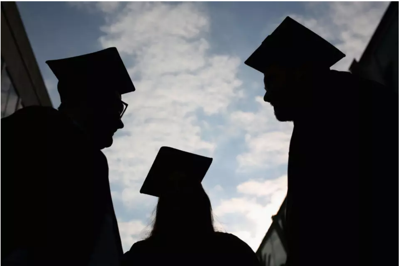
The UK is well represented in the 2017 Young University Rankings but Brexit has left them vulnerable to losses in funding and international students