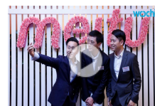
What Is Meitu? The Kawaii