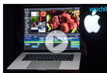
Is Apple All It's Cracked Up